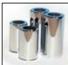
ХРОМИРОВАННАЯ ЗАЩИТА АМОРТИЗАТОРОВ CUSTOM 59 €/(ЗА ПАРУ) № ИЗДЕЛИЯ: CHROMECOVER

Отличная замена оригинальным амортизаторам. С регулировкой жесткости пружины, с двухконтурной системой регулировки хода поршня как вверх, так и вниз; чем выше скорость, тем амортизационный эффект сильнее.